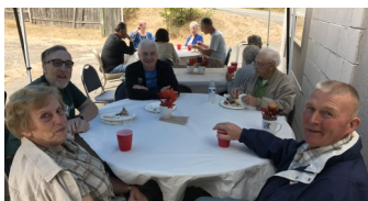
This year's volunteer appreciation picnic