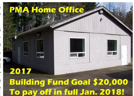
PMA Home Office

What a blessing it will be to have a permanent home of our own for PMA, with no mortgage payments. The money previously used for mortgage payments can now be used to further the ministry of reaching prisoners for Christ.