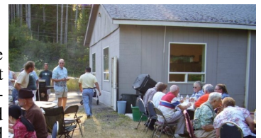
Current location— 6549 Sidney Rd. SW

In 2009, Karen became aware of a church that was unfortunately closing its doors. They had been using a converted garage for their offices so