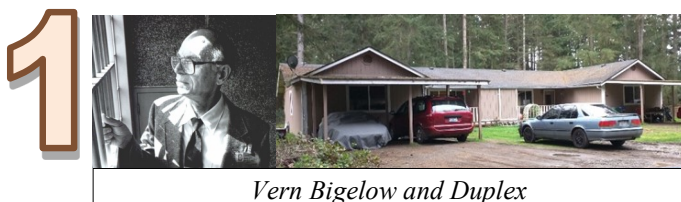
Vern Bigelow and Duplex

Vern Bigelow brought the ministry of PMA to Port Orchard and operated it from a duplex next to where we lived. Lessons were processed and mailed from their living room and records were kept on 3X5 cards and stored in shoe boxes. Looking back it seems quite primitive but lessons were being sent and inmates were being saved and growing in their love and knowledge of the Savior.