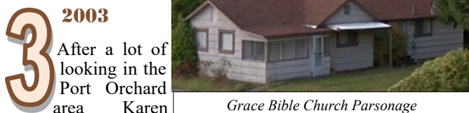
Grace Bible Church Parsonage

After a lot of looking in the Port Orchard area Karen approached the Grace Bible Church of Port Orchard, about