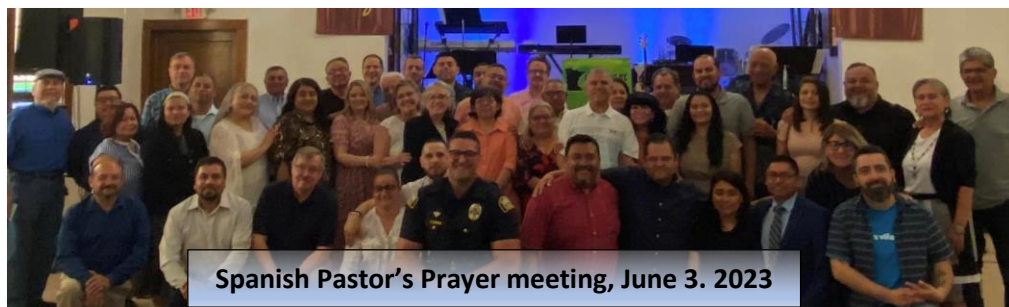
Spanish Pastor's Prayer meeting, June 3, 2023